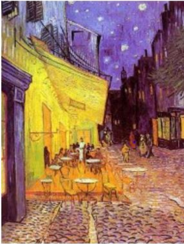
Cafe Terrace at Night