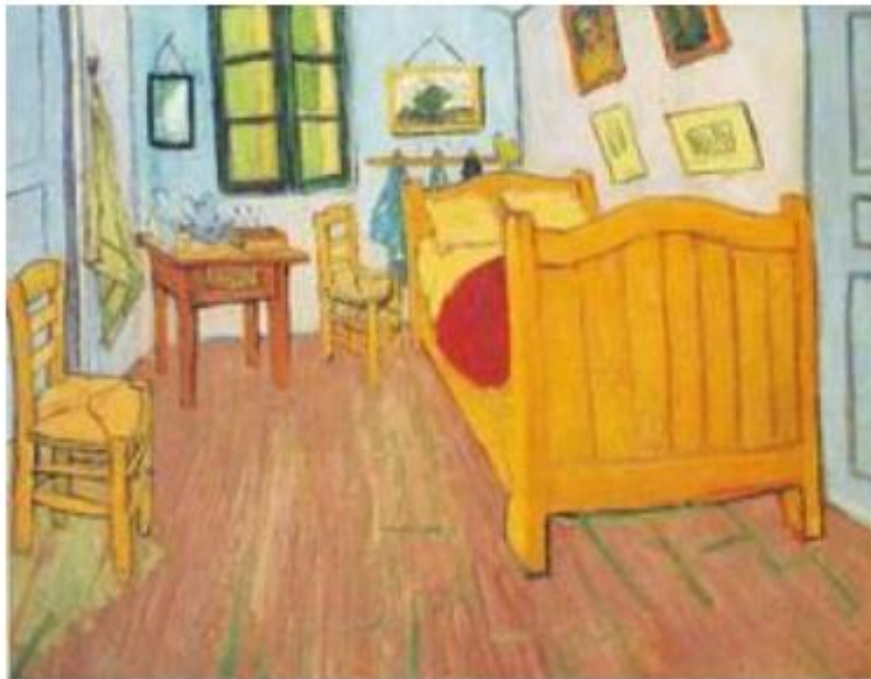
Bedroom in Arles