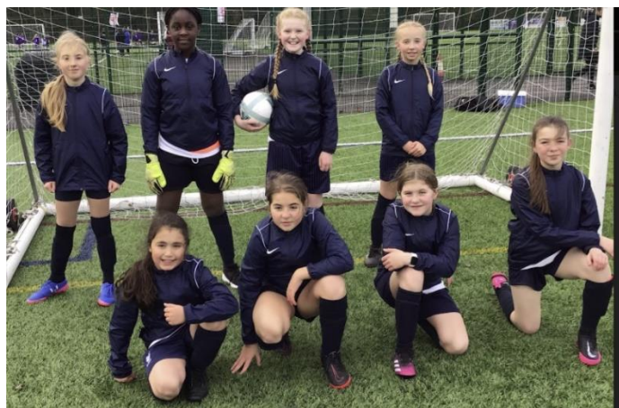
The Girls Football team – Autumn Team

Here at Monksdown we are lucky enough to be full to the brim with talented footballers.