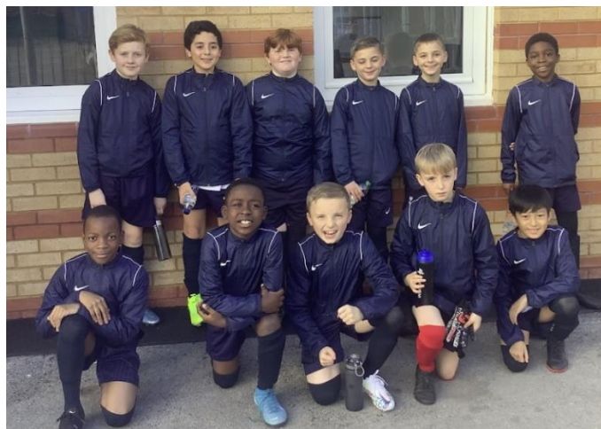
The Boys Football team – Autumn Term

We have a wide selection of both boys and girls to choose from for our school footballers to choose from for every game. Children wanting to be part of the school football team must ensure they sign up for football practice and show good sportsmanship at all times.