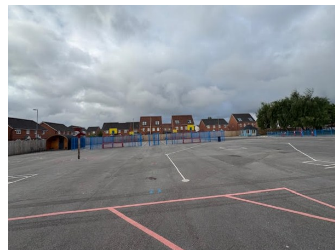
This is my playground.