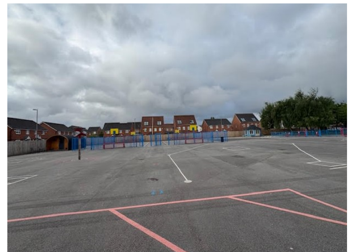
This is my playground.